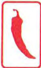
Picante = pee/can/tay

INSTANT LATIN AMERICAN SPANISH — SPEAK SPANISH BY SPEAKING ENGLISH