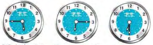
5:45 = lass kwar/toe par/ra says 6:15 = says ee kwar/toe 6:30 = says ee med/ee/ah