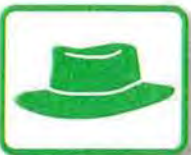
Sombrero = psalm/br/air/owe