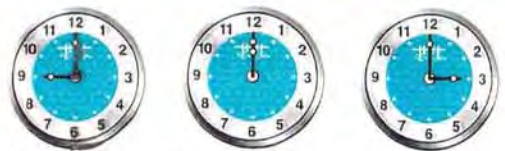
9:00 = new/wew/ay noon = med/ee/owe/dee/ah 3:00 = tress