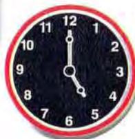
Cinco ora = sink/owe ore/ah